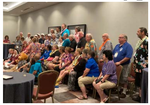
Hawaii and Illinois Lions held a get together in a tradition that started decades ago