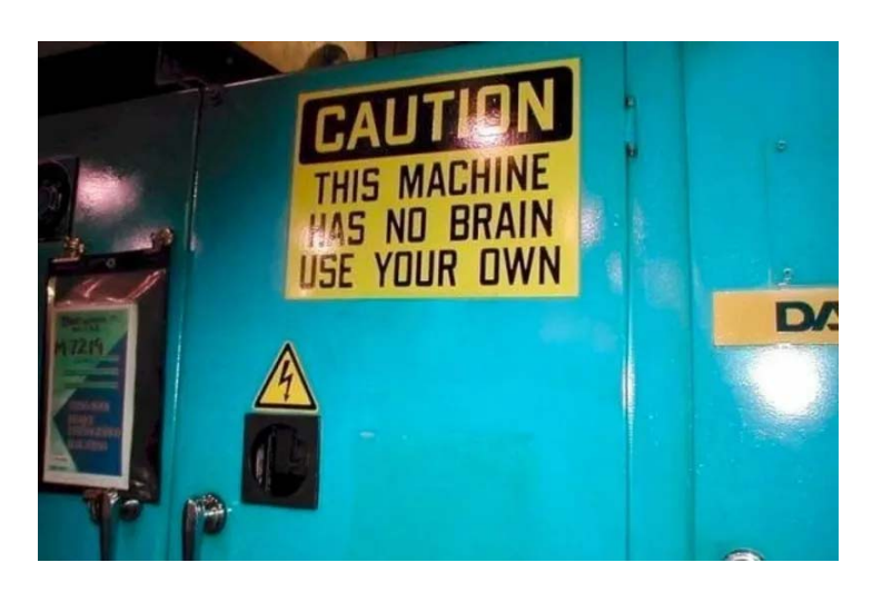
SIGN OF THE TIMES