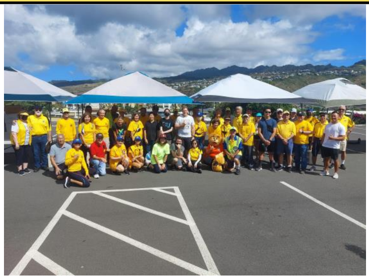
Hawaii Kai Lions and volunteers after serving 2,853 meals.