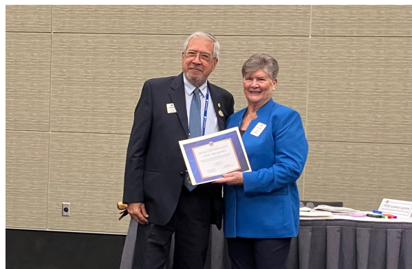
DG CJ receiving Certificate of Completion at District Governor Training