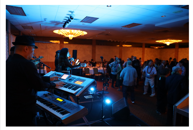
The 2023 convention will be one of the most memorable...until next year...