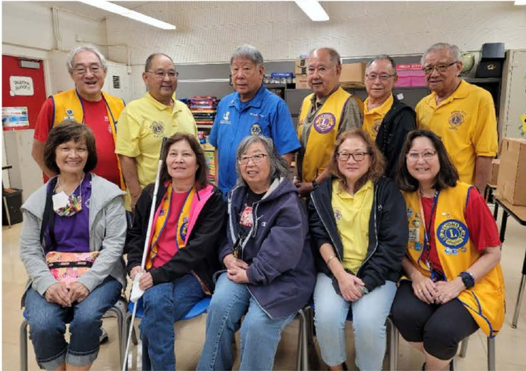
6 Pearl City Lions, 15 total man hours, plus 5 Lion Guests