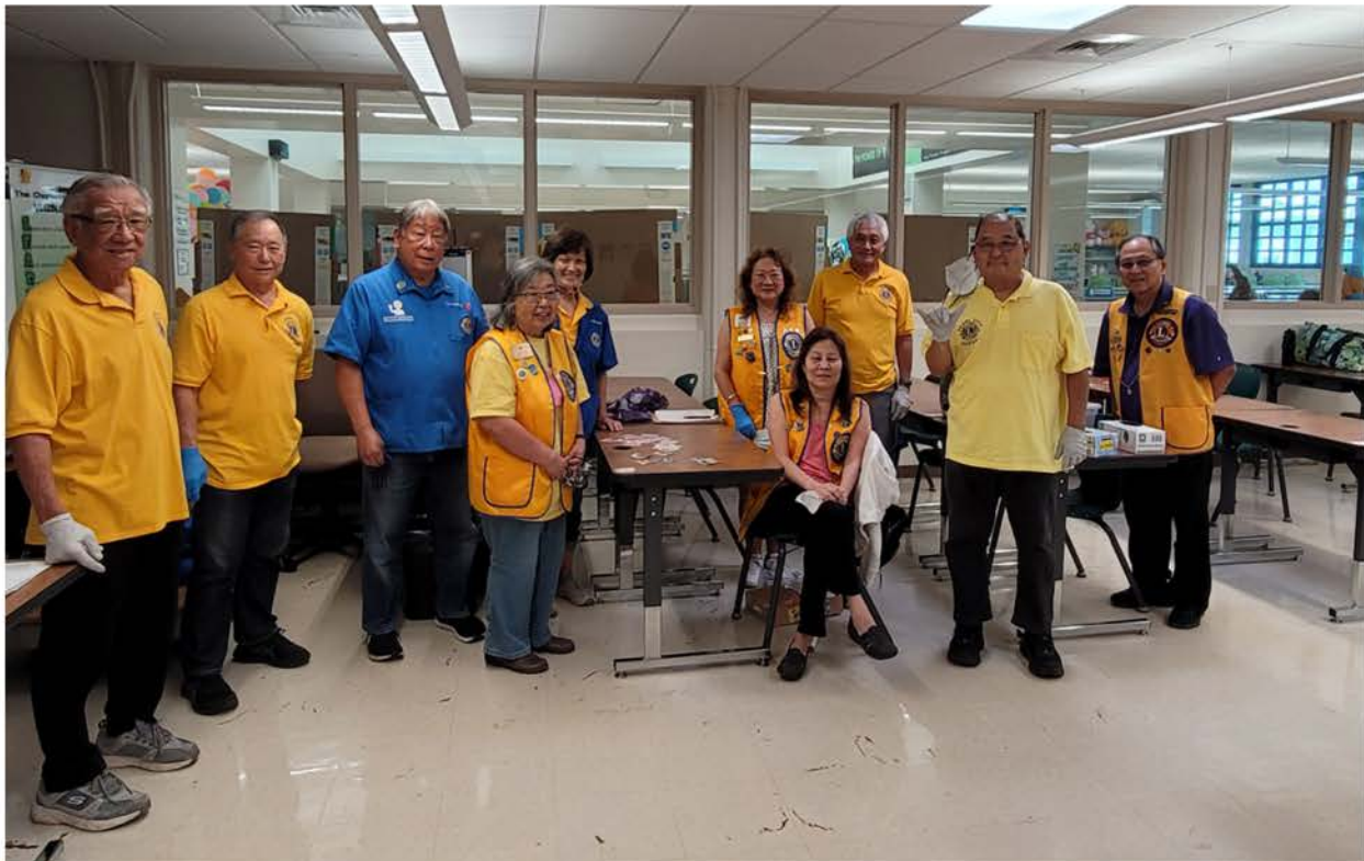
8 Pearl City Lions, 11.25 total man hours, plus 2 Lion Guests