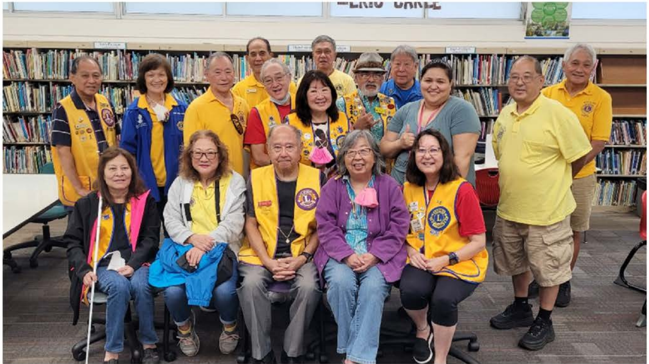
8 Pearl City Lions, 10 total man hours, plus 8 Lion Guests