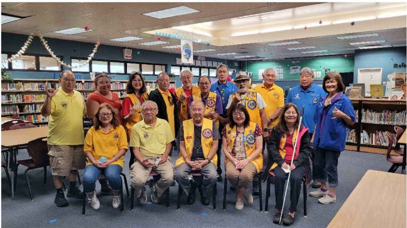
8 Pearl City Lions, 10 total man hours, plus 8 Lion Guests