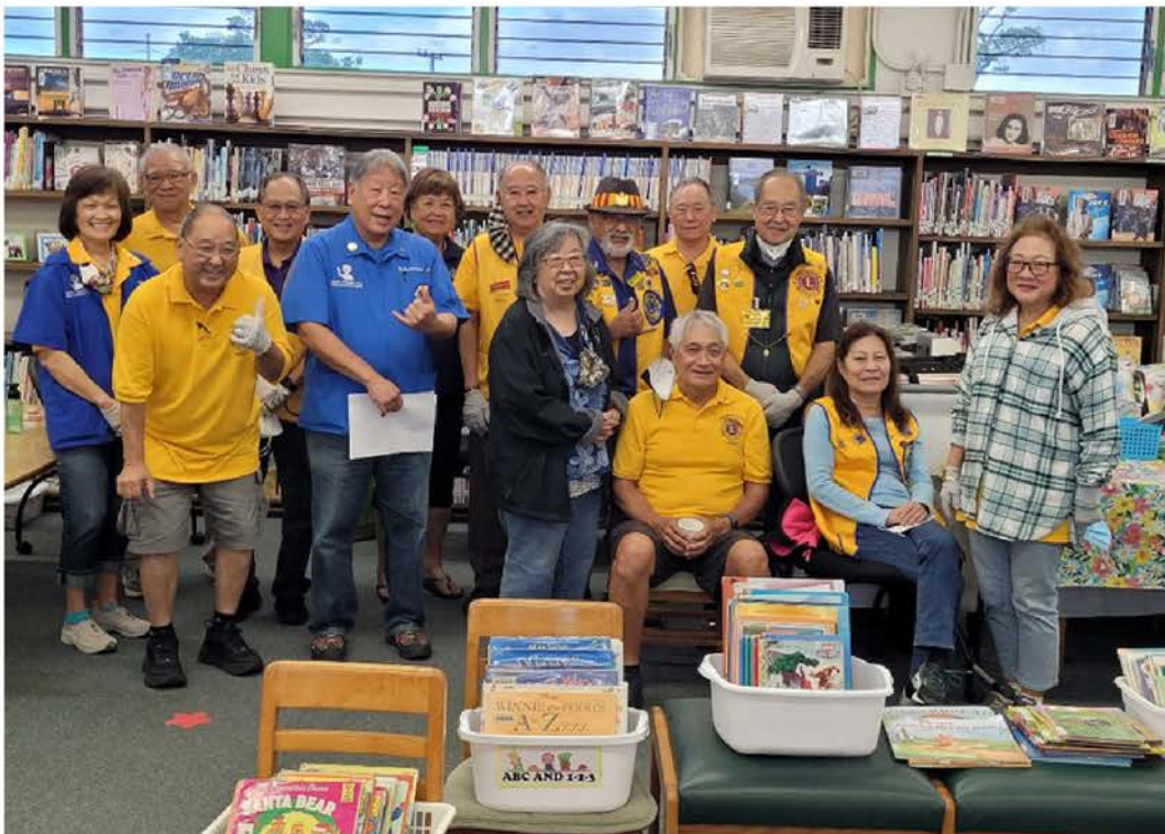
8 Pearl City Lions, 12 total man hours, plus 6 Lion Guests