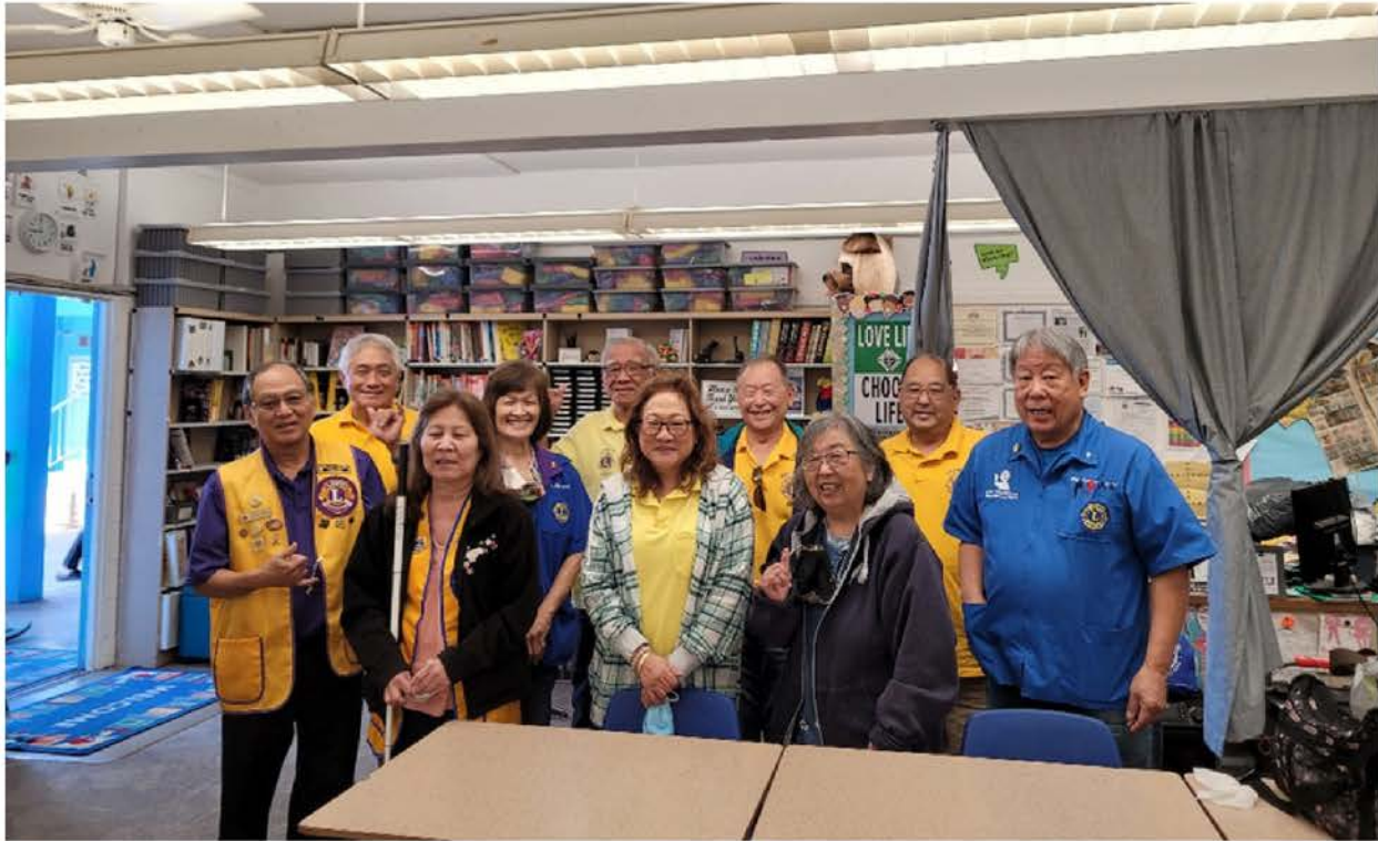
8 Pearl City Lions, 10 total man hours, plus 2 Lion Guests

OUR LADY OF GOOD COUNSEL HEARING SCREENING (MAR 9, 2023) BY TAD