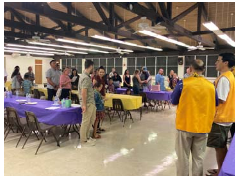
The Poster Contest dinner was held at the Kailua Rec Center