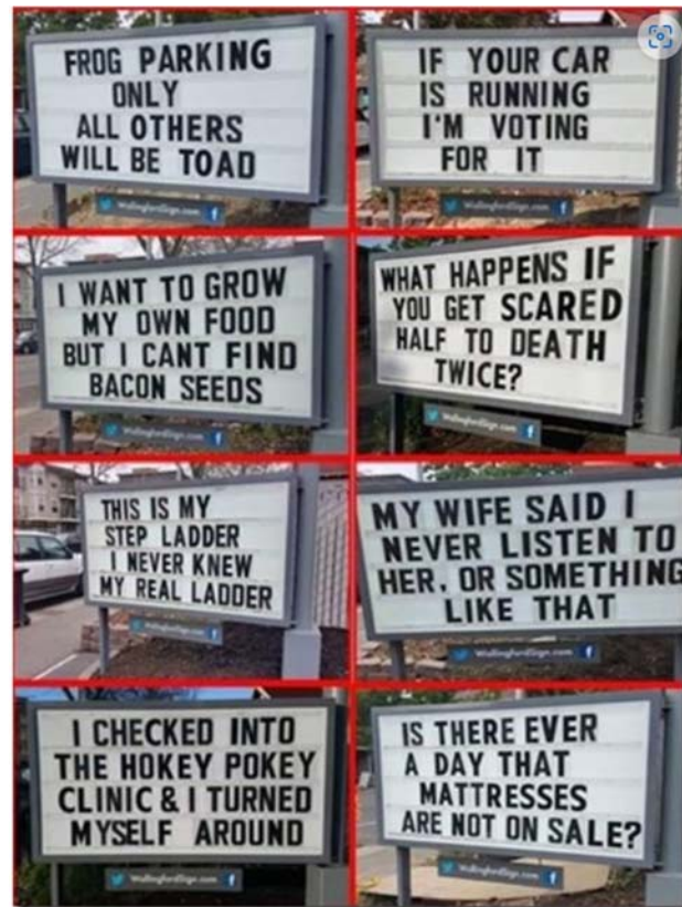
Funny signs of the times:

Koolaupoko Lions Club Kailua Information Center