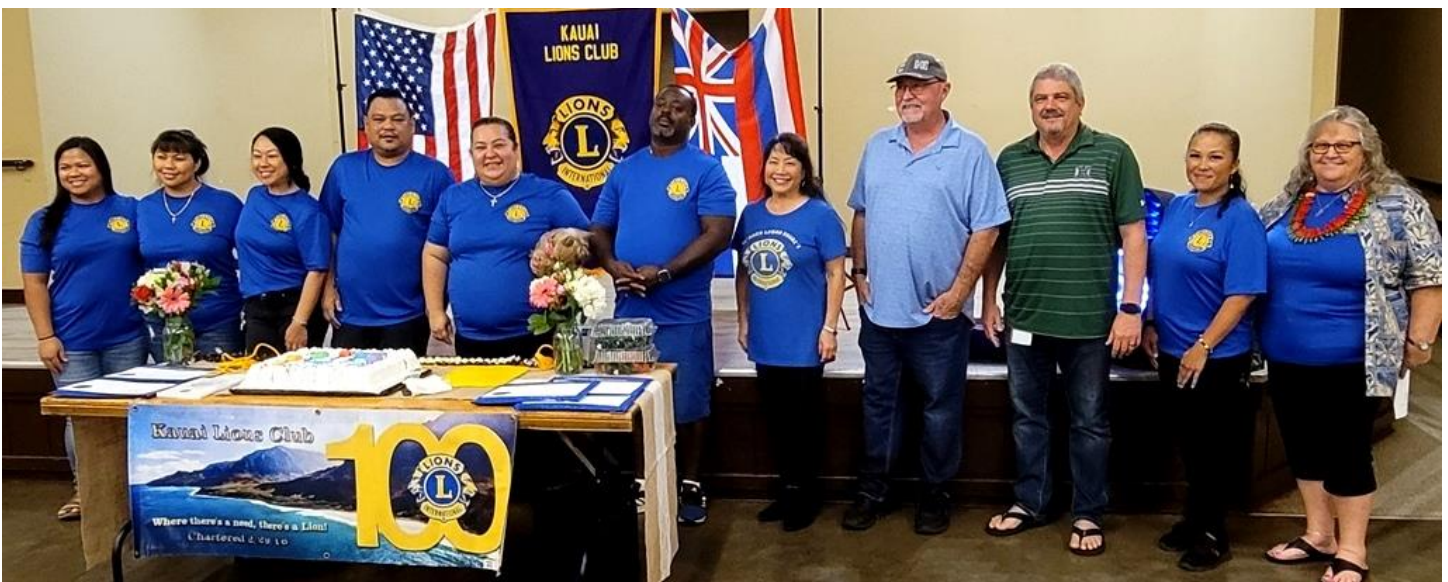
Charter Members of Kaua'i Lions Club chartered on Leap Year Day, Feb 29, 2016