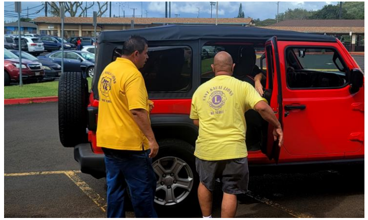
In between dashing to cars and tables for talk story: