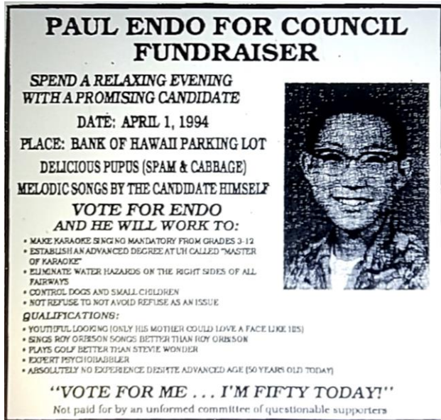
Fun flyer distributed on bingo night.