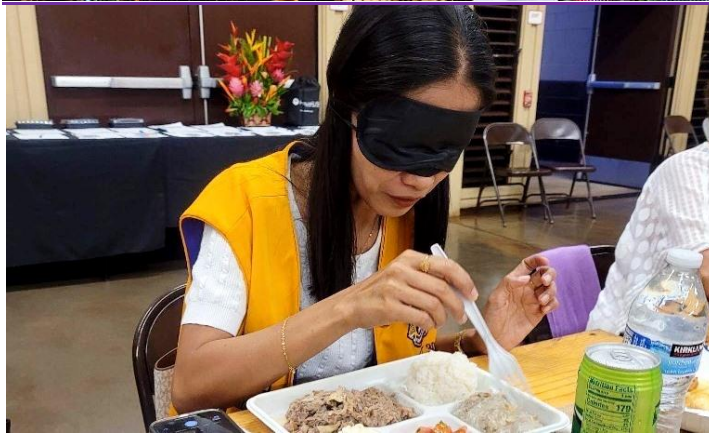
Blind dinner to promote appreciation of sight.