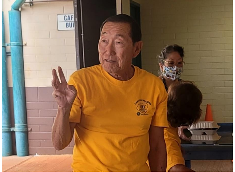
Taking charge in his department at the club fundraiser