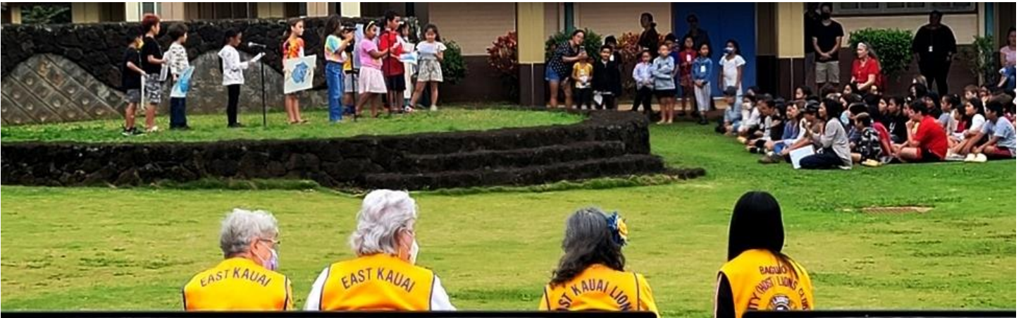
A school assembly momentarily sidetracks Lions on their way to the office where the service project happens.