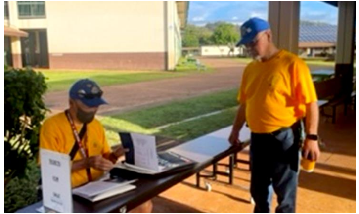
In the cafeteria: