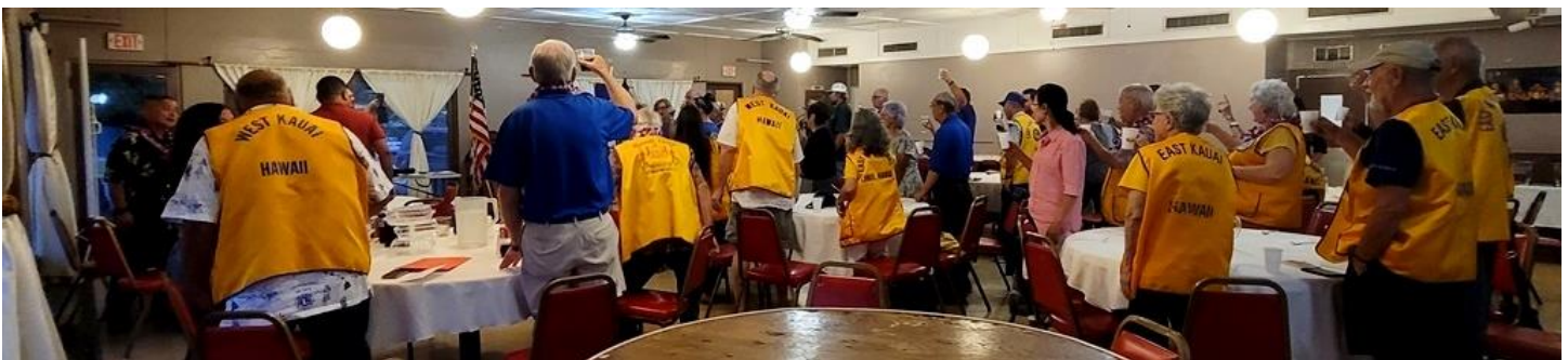
A Toast to West Kaua'i Lions Club on Its 85 th Charter Anniversary Celebration