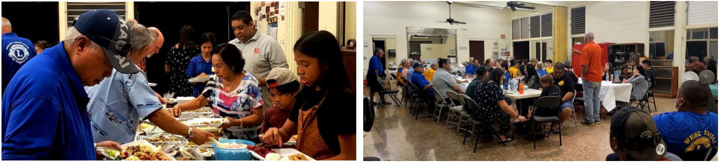
West Kauai Lions, well known for their cooking prowess, love to do things like this and do is often.