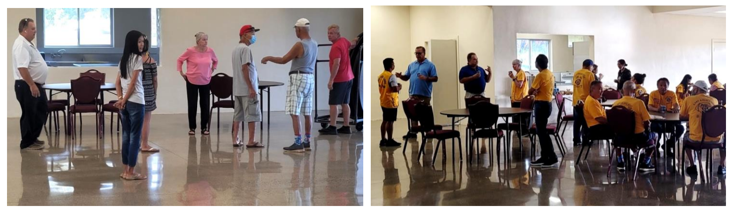
Lions setting up the day before, fueling up the morning of, the diabetes clinic

Fifty individuals were tested, 60+ attended each educational session, 30 agency people and 20 Lions volunteered.