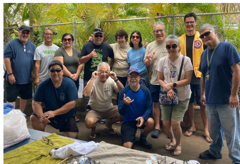
Lions at work: Eyeglass cleaning and recycling