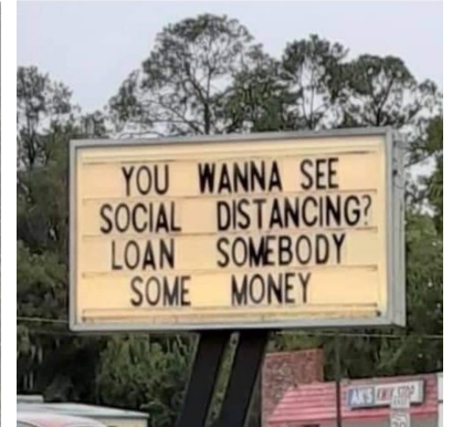
Funny signs of the times: