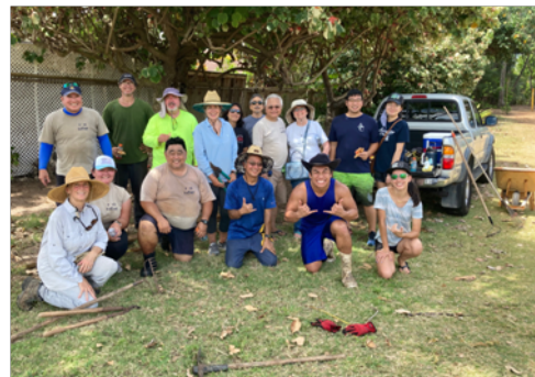
Lions at work: trimming and clearing invasive