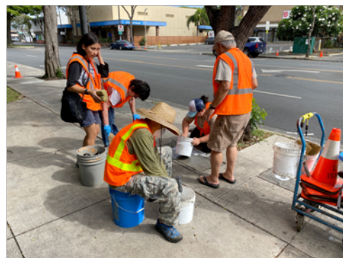
Lions at work: Safe Sidewalk Project—patching and repairing sidewalks in Kailua town