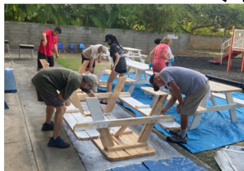
Lions at work: Painting of over a dozen picnic tables for St. Anthony School