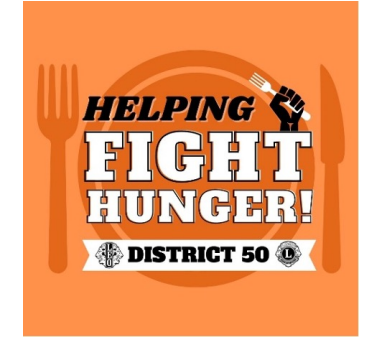
Taryn's winning Hunger design

awarded $100. We weren't able to print the t-shirts due to timing issues but hopefully the design will be adopted by future Hunger chairs for future use.