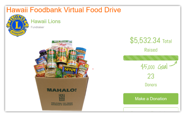
Waikiki 2000 & Hawaii Kai Lions clubs along with 15 individuals made donations totaling $3,556 on the Hawaii Foodbank Hawaii Lions website. The $5,532.34 includes the $1,976 cash and check donations collected at the State Capitol on Saturday, November 19.

On Oahu, about 60 Lions and Leos came to the State Capitol on November 19 to collected canned goods and donations. Lions from Kahalu'u, Kapahulu-Moiliili, Palolo, Hawaii Kai, Chinatown, Honolulu, Leeward, Manoa, Hawaii Filipino, Mana Loa-Nimitz, Waikiki 2000, Kaneohe, Mililani, Pali,