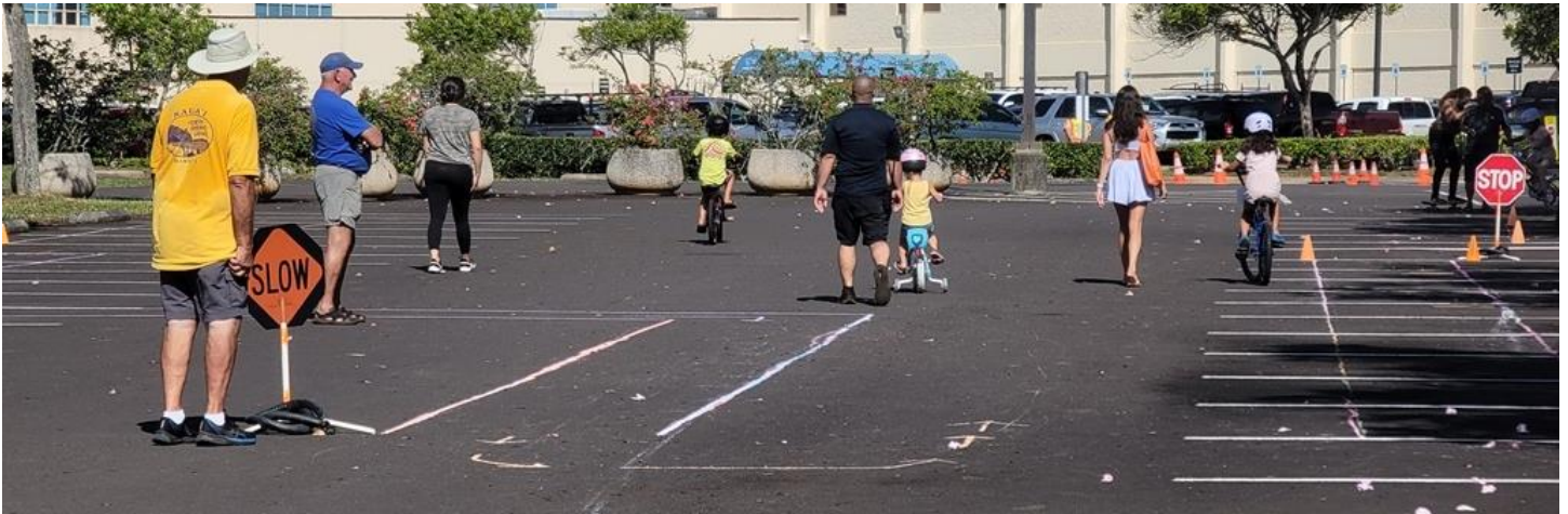
North Shore Lions commandeer parking lot to promote safety practices such as hand signals and stopping on time.