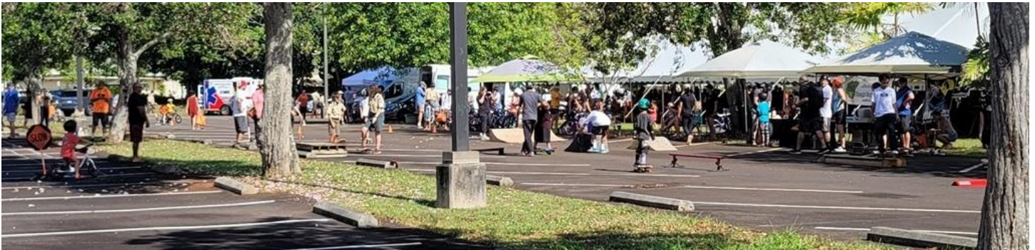
Skateboarding safety is promoted by other community organizations with emphasis on use of helmets.