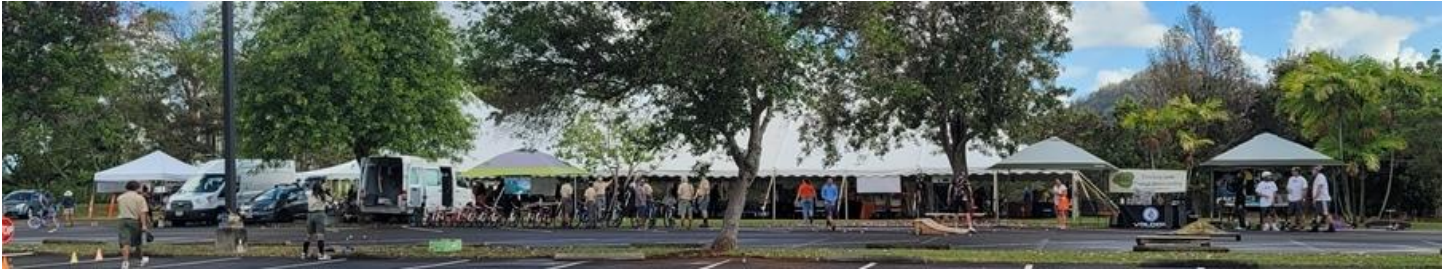
Venue is parking lot of Wilcox Medical Center, sponsor-coordinator of keiki bicycle-skateboarding safety project.