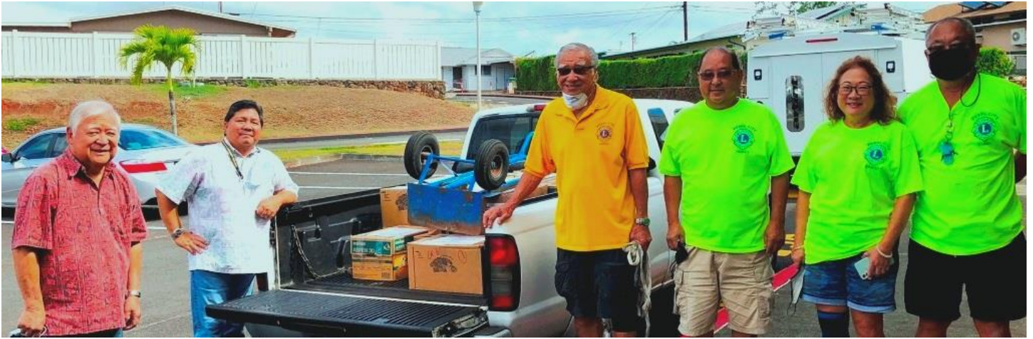
Pearl City Lions stand by with textbooks loaded, ready to be shipped to Baguio City Host Lions Club, PHI.