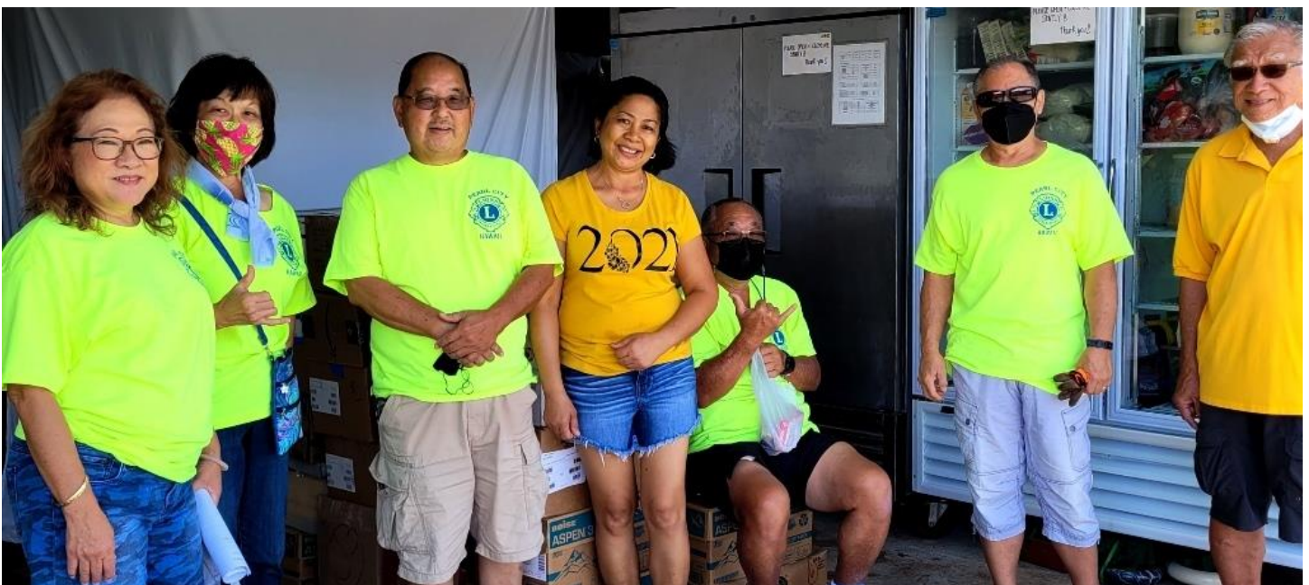
Pearl City Lions receiving the textbooks from Manana Elementary School in collaboration with EKLC