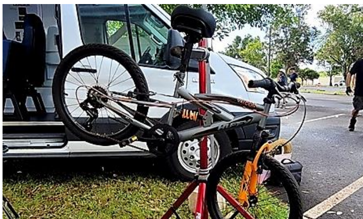
Bicycles are readied for inspection at Bicycle Safety Inspection Station.