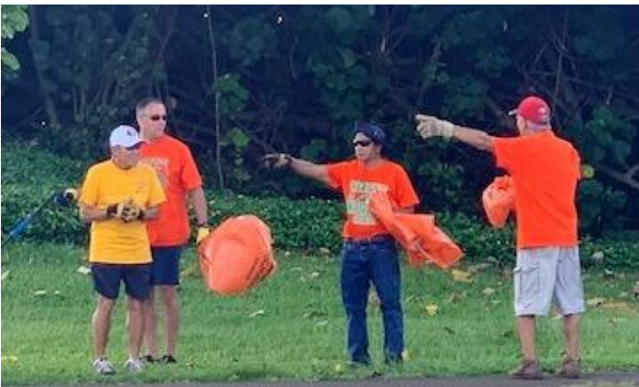
"You'll find more trash over there!"