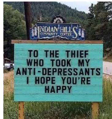
Funny signs of the times