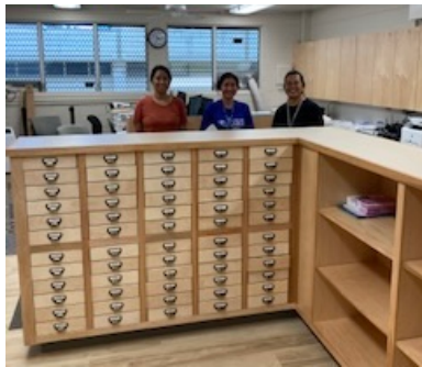
Mail cubbies for faculty & staff

On August 2 nd Hahaione Elementary School students, parents, teachers, and staff returned