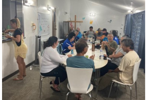
Quite a crowd at our last club meeting