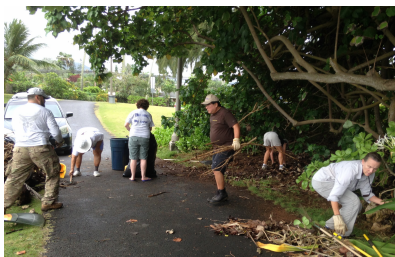
Kalama Beach Park clean up done in 2019 before covid.

Pali Lions next project is the clean up of the grounds of the Kalama Beach Park. The beach park is located at 284 N. Kalaheo Street in Kailua. We will be partnering with the Outdoor Circle to cut and clear the grass and trim the trees surrounding the park. We will meet at 8 am. There is an access road off the parking lot on the Lanikai side of the park. This is where we will meet and park. Please bring your garden tools such as weed wackers, clippers, rakes and garbage bags.