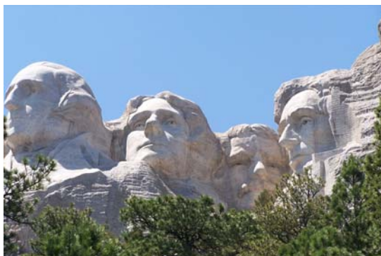
This is the very famous shot of Mt. Rushmore, but it is much more awesome when view in real life, and especially impressive during the night show with lights and music.