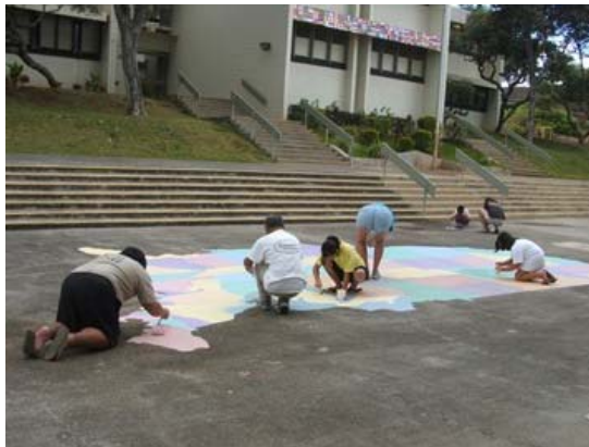
Lions singing "Whistle While You Work" were hard at work refreshing the colors of the United States map.