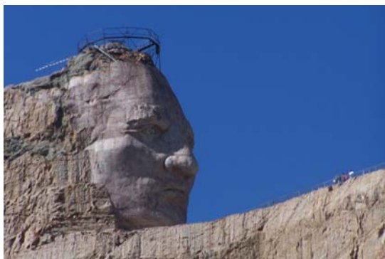
Not as well known as Mt. Rushmore but equally impressive is the carving of the Indian Chief known as Crazy Horse. When totally completed, the monument will be six times as large as Mt. Rushmore.