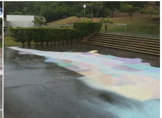
Unfortunately, in one rain shower, Alaska flowed into the West Coast and Maine stretched into the Atlantic Ocean.