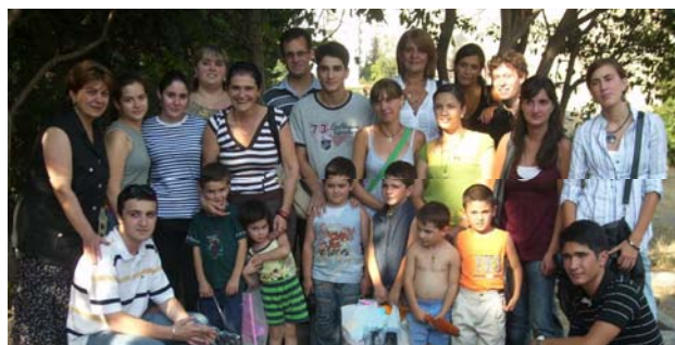
Georgians want to form a Leo Club to aid war victims